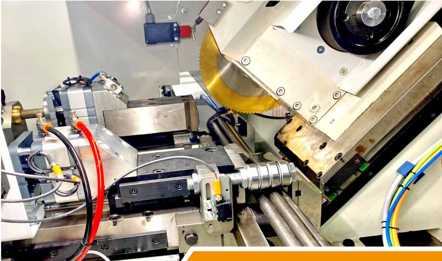
Simultaneous cutting: 4 pcs