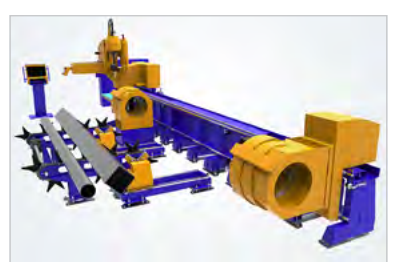
Automatic loading, feeding and unloading

The PipeCut series can be fully automated via handling systems and CyberFab® Manager software, including: