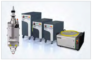
High-quality components from renowned brands

High-quality components combined with MicroStep's dynamic motion control ensure excellent quality and long-term reliability of the cutting results. Here is a short excerpt: