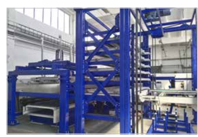
MSTower: Customized storage solution

Standard MSTower comes in sizes from 3 x 1.5 m to 6 x 2 m and accommodates up to 10 loading palettes. However, MicroStep's offer does not end there. We offer custom solutions in terms of palette size and number, as well as integration with supplementary technology.