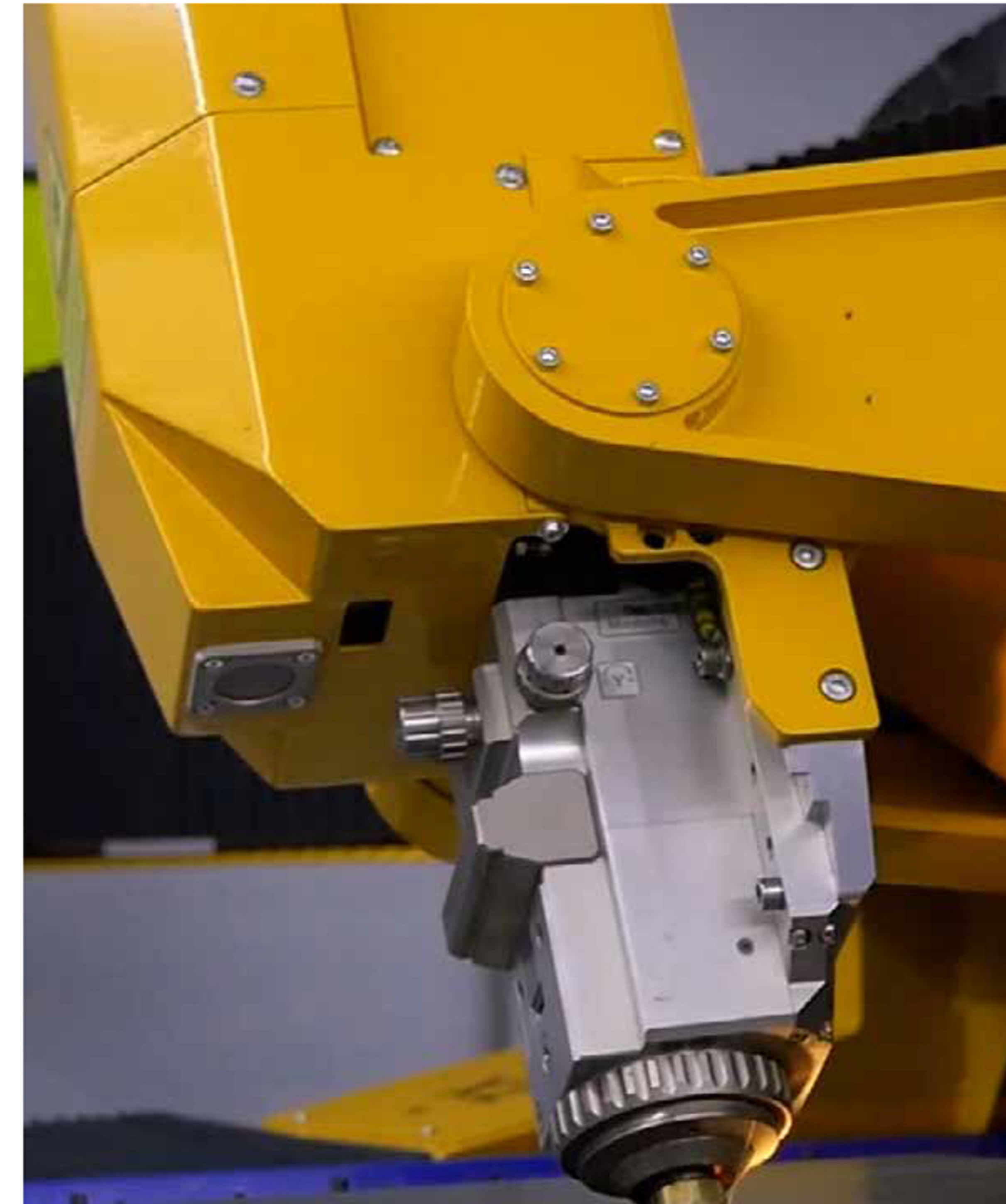
Laser bevel head allows 3D processing of sheets and pipes