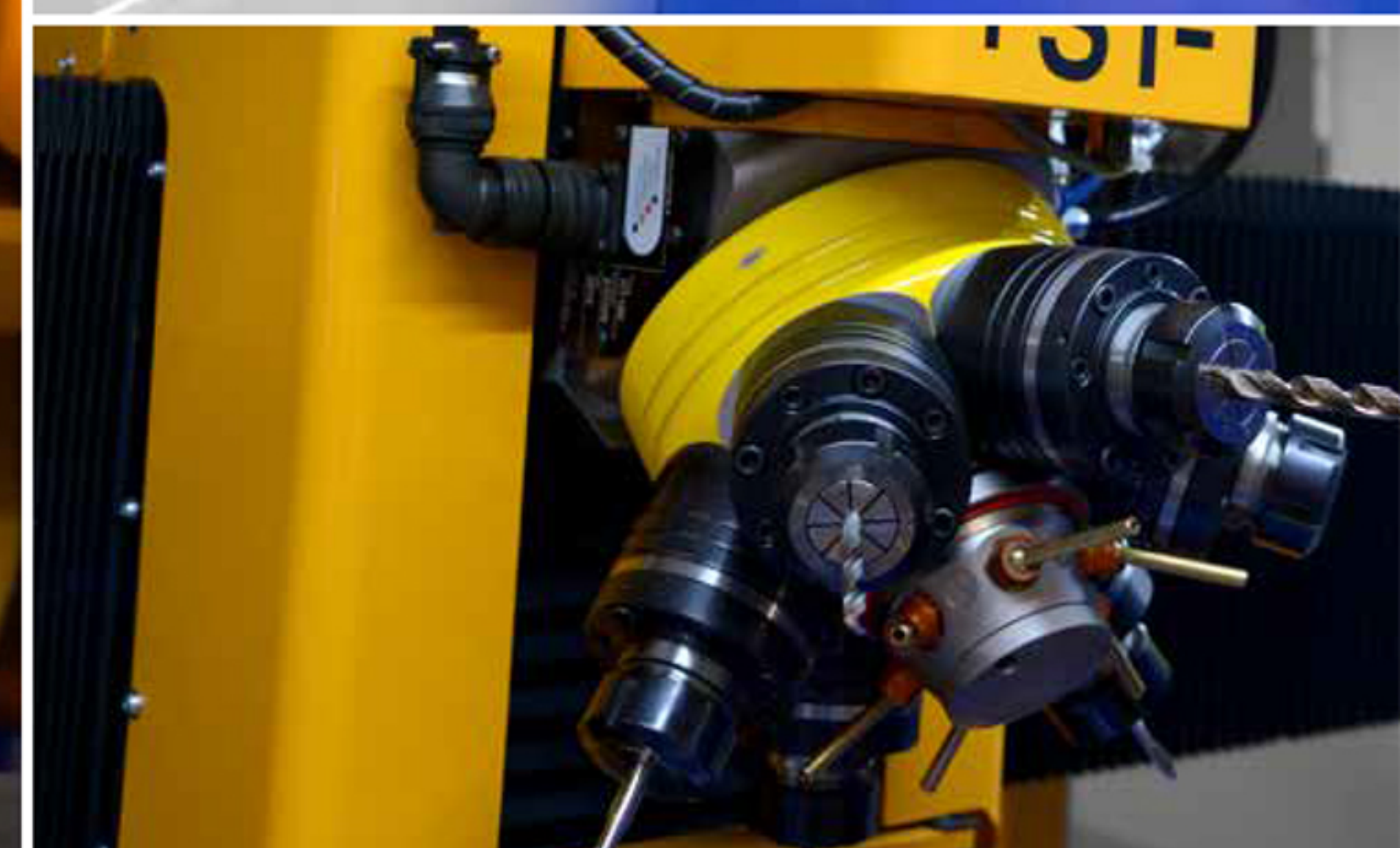
Turret drilling head with 6 tool positions for drilling up to Ø 20 mm and tapping up to M16