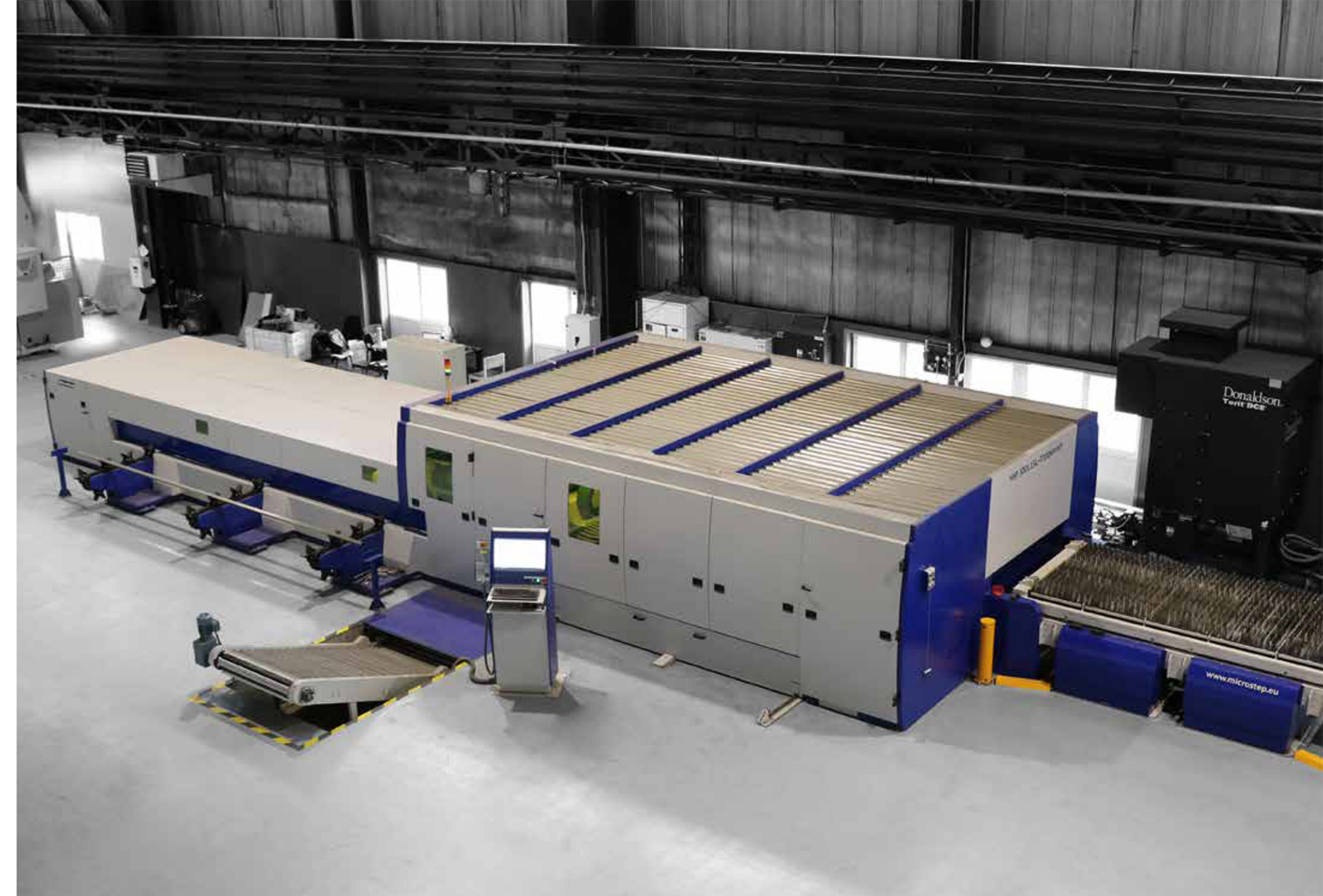
A versatile CNC fiber laser cutting machine for sheets and pipes with laser power up to 10 kW