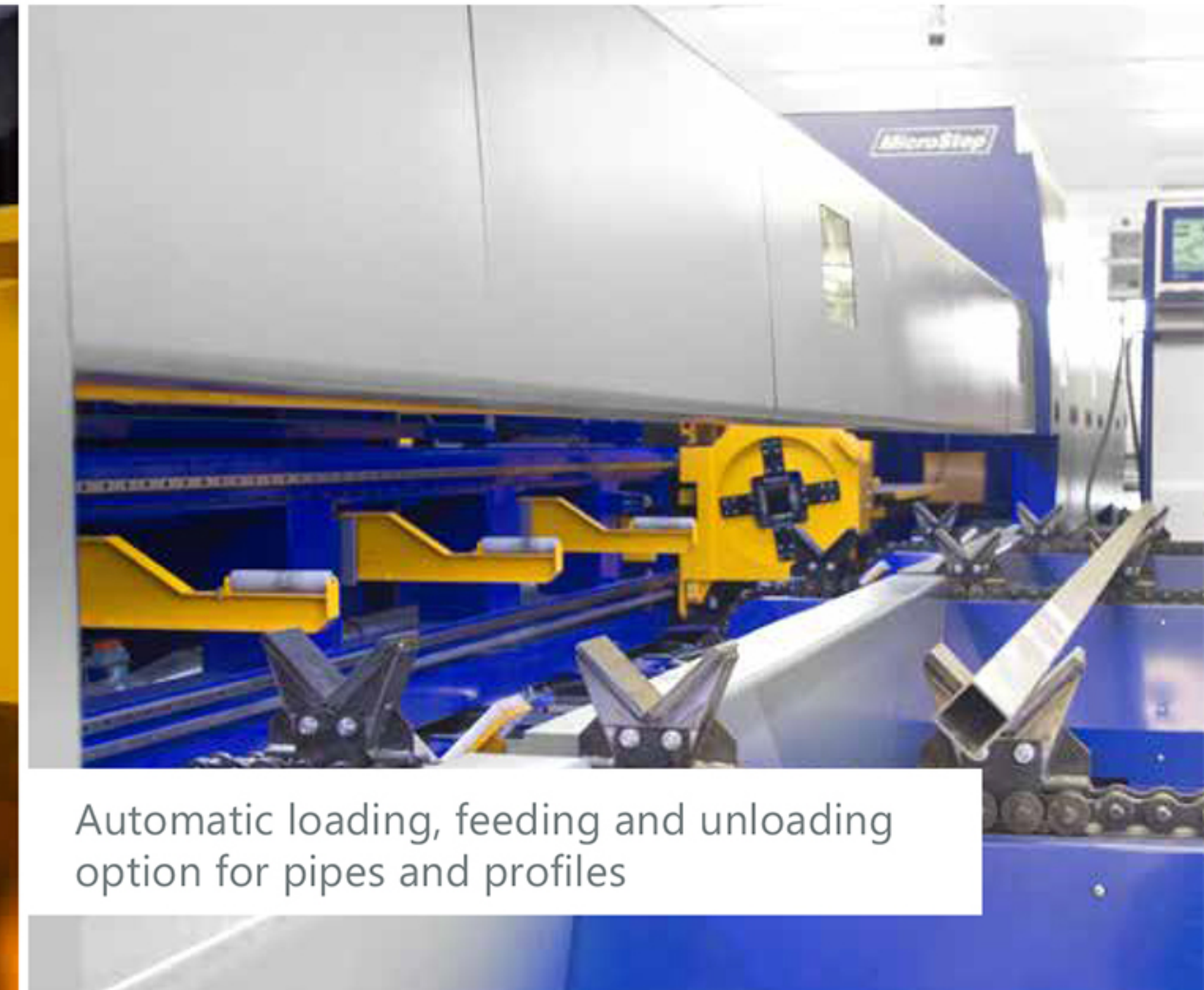
Automatic loading, feeding and unloading option for pipes and profiles