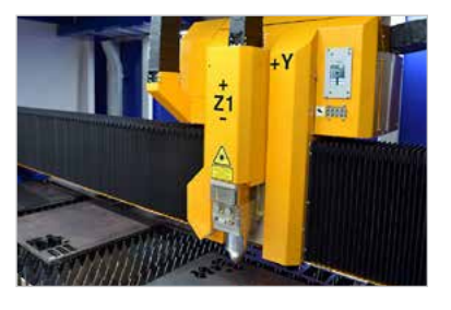
MicroStep relies exclusively on high-quality components from established manufacturers to ensure long-lasting and accurate results. Thus, laser sources from IPG Photonics with a power of up to 4 kW are available. For high cutting speeds, an automatic laser cutting head from the German manufacturer Thermacut is used.