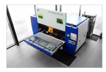
Compact machine with manual loading and unloading

The MSF Compact is available with work areas of 1,000 x 2,000 mm, 1,250 x 2,500 mm and 1,500 x 3,000 mm and is particularly attractive thanks to its small footprint in combination with the genuinely high cutting quality. A manually extractable cutting table enables easy and straightforward loading.