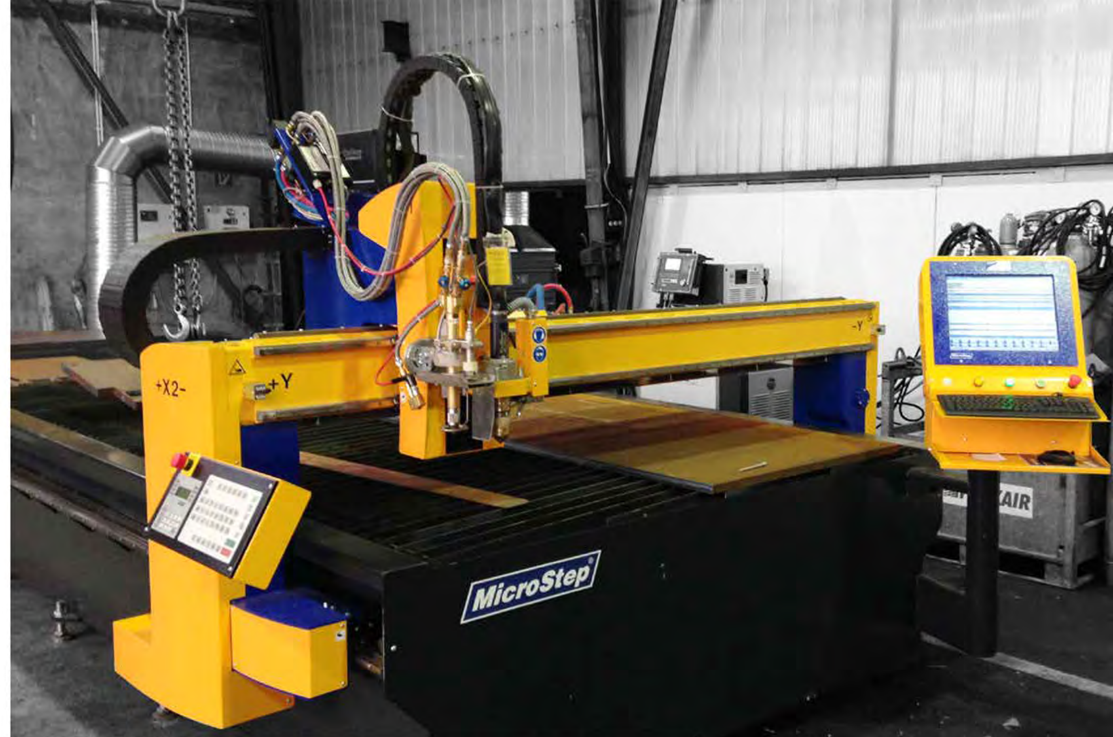
MasterCut Compact machine designed for small and medium-sized businesses

The machine maintains an uncompromising quality of components – linear guidelines in all axes, helical gears, sturdy gantries and monitoring of all electronic components ensure a seamless operation.