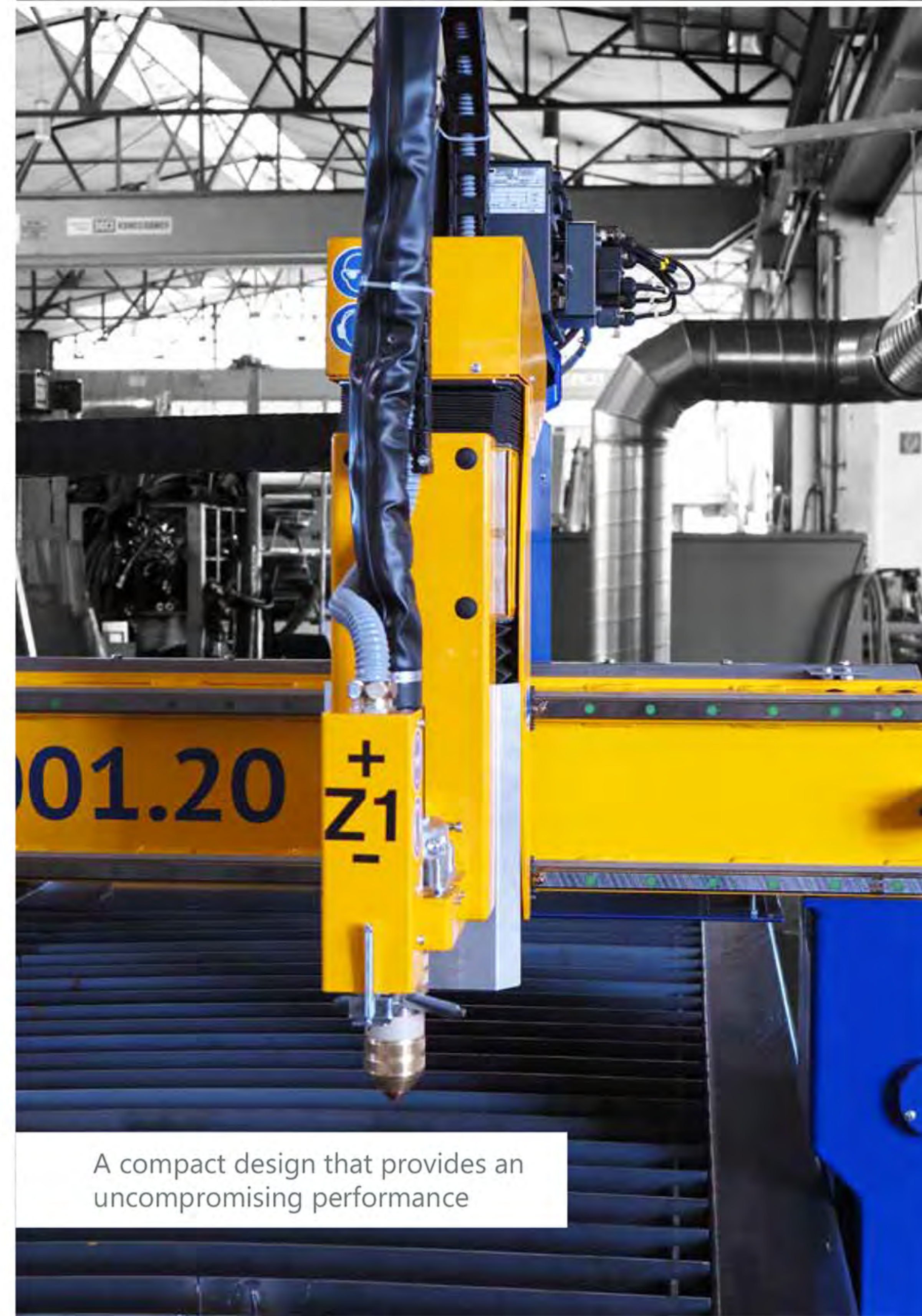
A compact design that provides an uncompromising performance