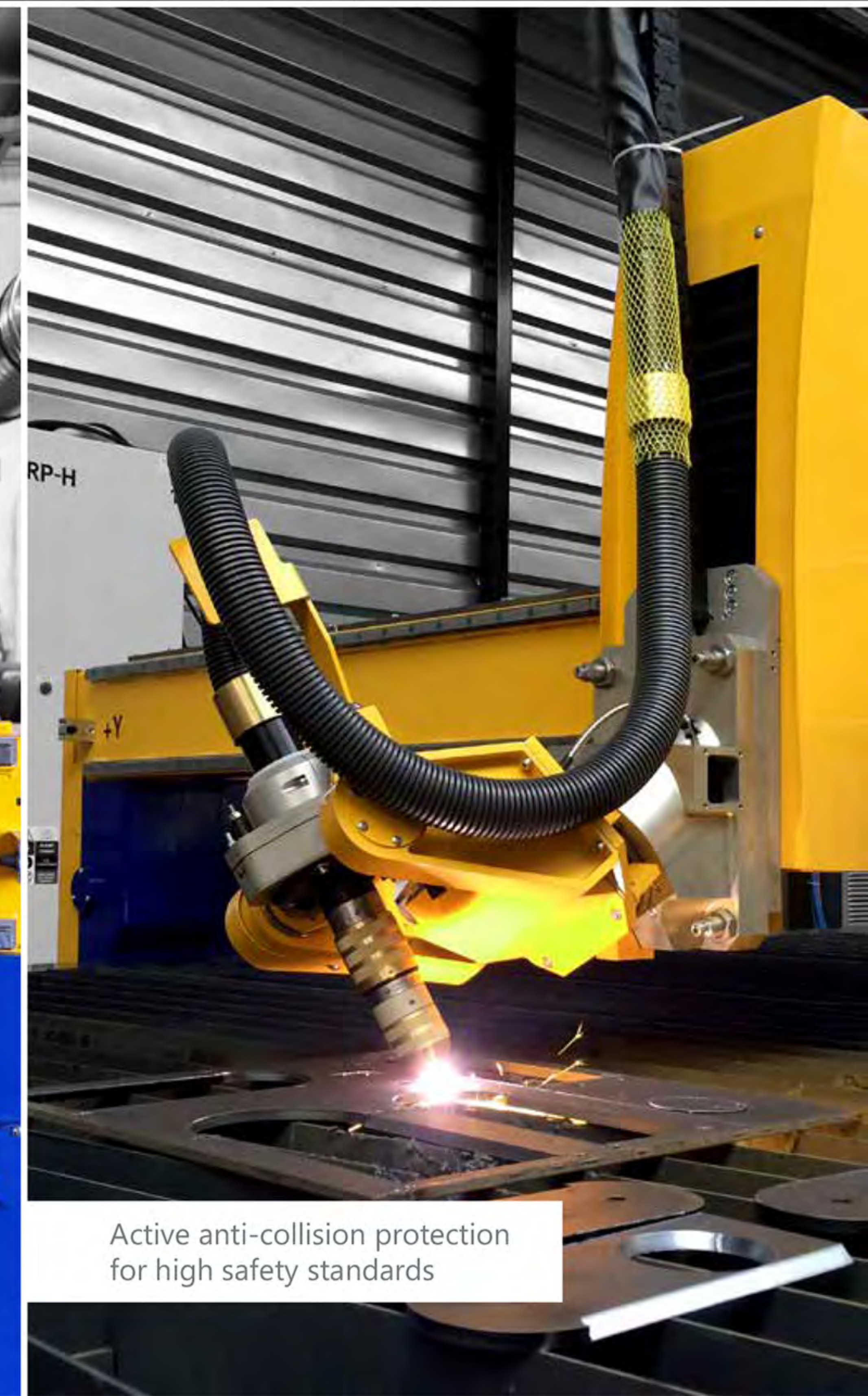
Active anti-collision protection for high safety standards