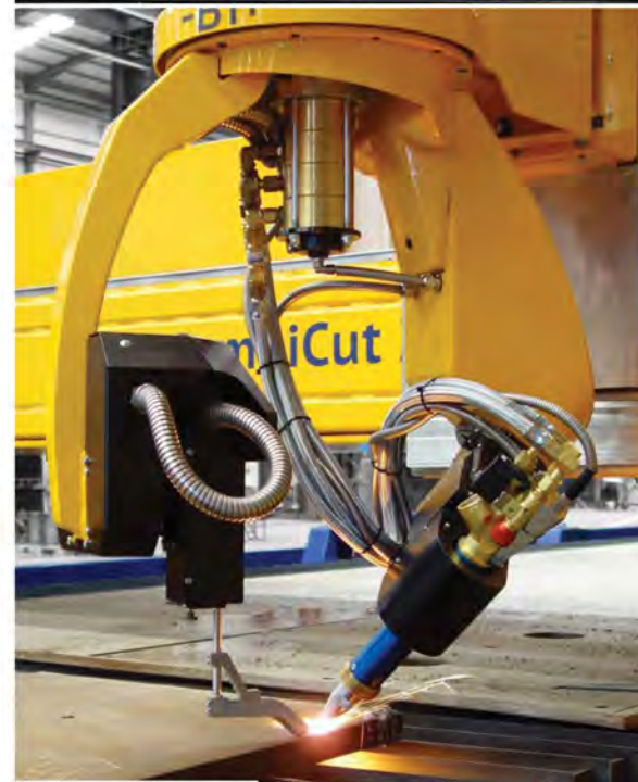
Bevel cutting with oxyfuel rotator