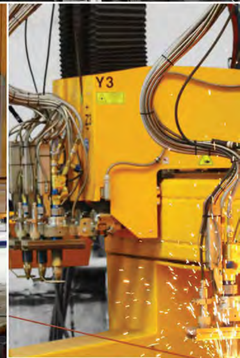
Integration of up to 8 oxyfuel tool stations on one gantry