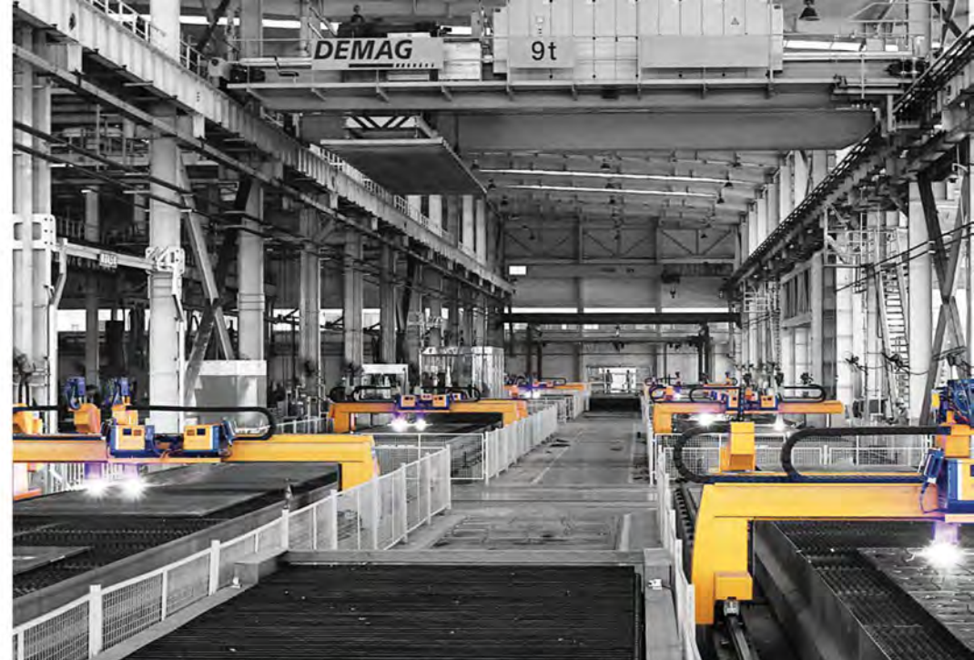
Automatic production line with several double-gantry CombiCut machines